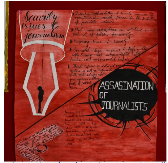
A creative sketch on Assassination of Journalists